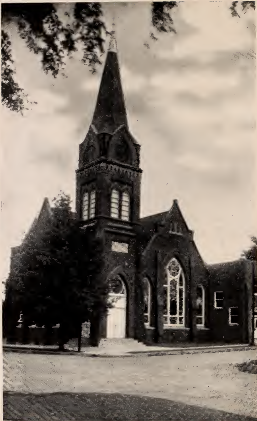
FIRST METHODIST EPISCOPAL CHURCH SOUTH, BROWNSVILLE, TENN.